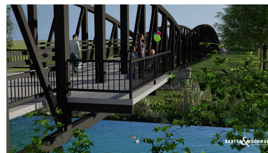
Clearmont Pedestrian Bridge Rendering